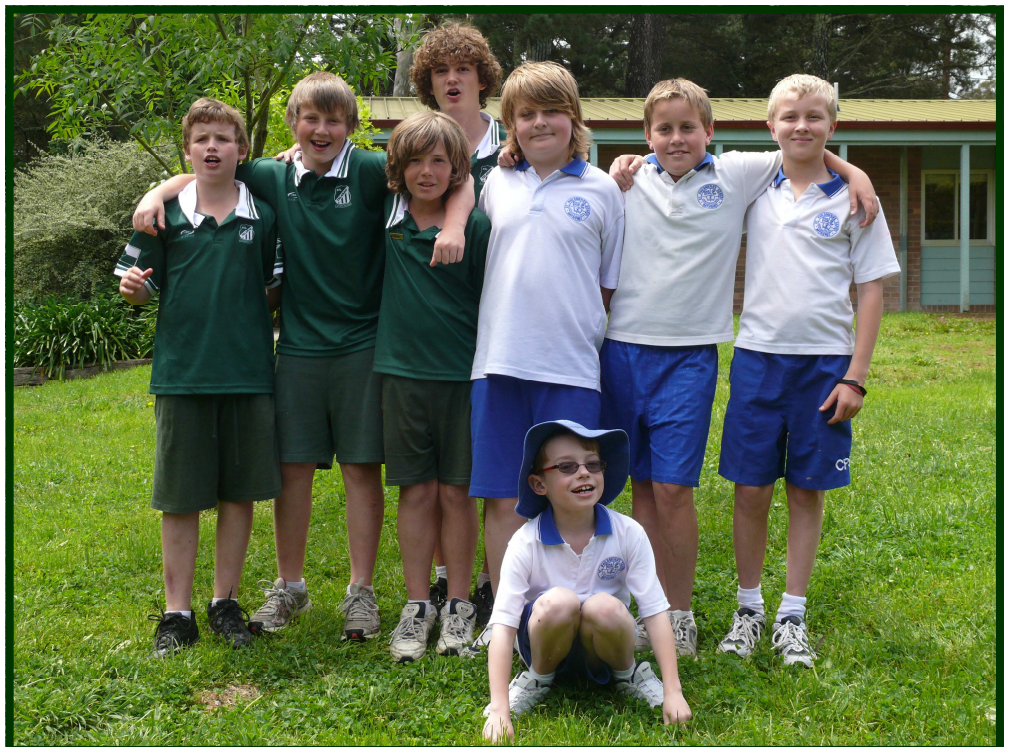
Photo (above) Students from St Philomena's (Bathurst) and from Telarah PS met at Katoomba North Public School to play the Inter-regional Country quarter-final.