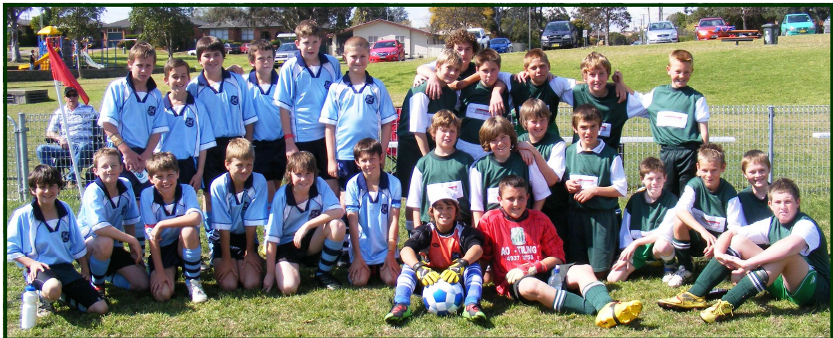
Above: Round 5—Boys team with Muswellbrook PS Below: Round 5—Girls team with Singleton Small Schools